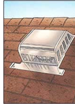
Roof Louvers or Slant Vents Also “750” or “Turtle” Typically - 50 sq. in.

Follow the same procedure; only multiply the square footage of the structure by .96 to get the number of square inches of required venting for the roof. NOTE: IT IS 4 TIMES THE AMOUNT OF VENTING!