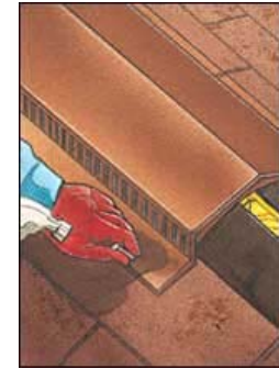
Ridge Vents Depending on the size of the opening at the ridge, and its length, this type can provide 3 to 4 times the required venting.