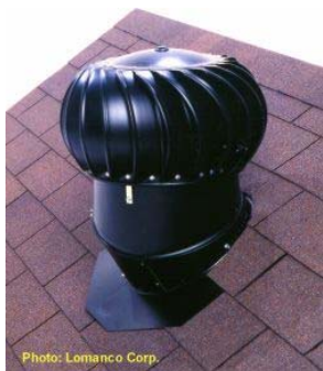
Wind Turbine or “Whirlybird” Typically – 12” circle or 122 sq. in.