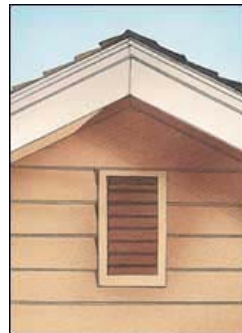
Gable Vents Typically sized adequately for the structure, but be sure the vents function fully.