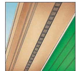
Continuous Soffit Vents Like the ridge vent, if the opening is large enough, the venting may be more than required.