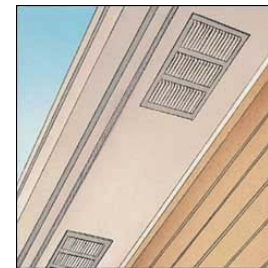
Soffit Vents Commonly found now with 2 sizes of openings: 3” x 14” & 7” x 14”