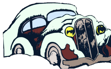
Parking regulations are enacted to provide for the efficient, effective and economical removal of snow.

shall be permitted, if not otherwise prohibited, whenever the entire length of roadway that block has been cleared of snow from curb to curb.